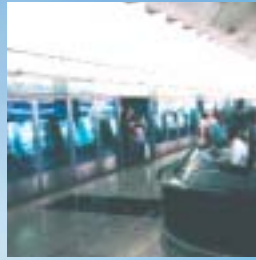
Airport Station, Hong Kong