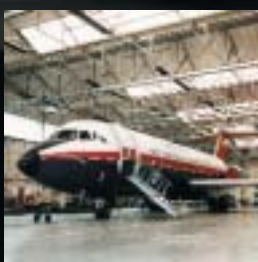
DERA Boscombe Down

DO NOT LEAVE BAGS OR SUITCASES UNATTENDED AT ANY TIME & FINAL CALL FOR PASSENGERS ON FLIGHT AX213 >> >> PLEASE GO TO GATE 15 WHERE YOUR FLIGHT IS NOW BOARDING >>