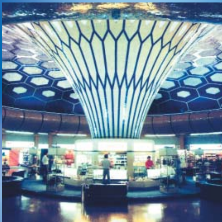
Abu Dhabi Airport

With over half a century's experience, Audix Systems have built up considerable expertise in design, manufacture, test and commissioning of complete sound systems to the highest standards for the airport industry.