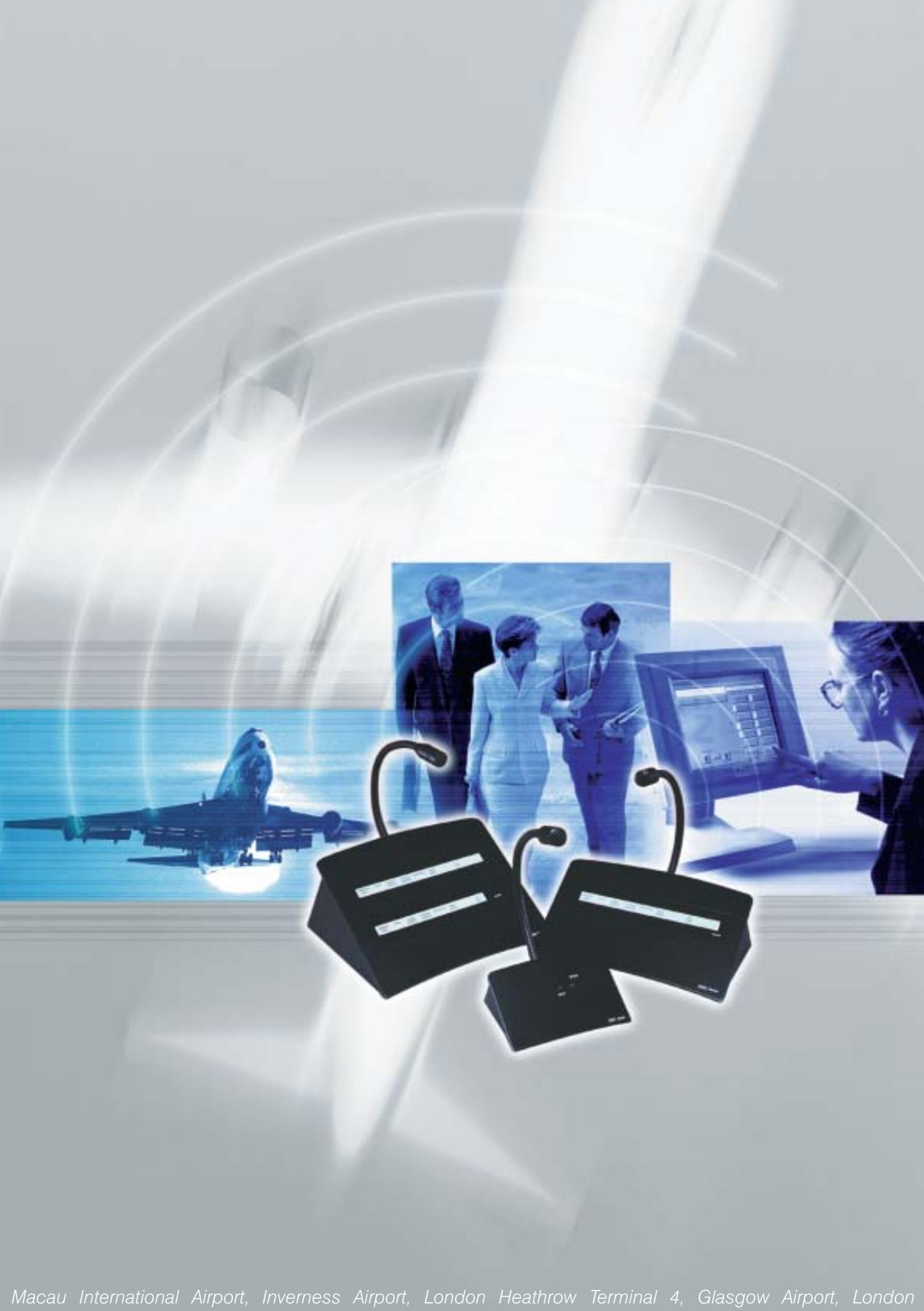
Macau International Airport, Inverness Airport, London Heathrow Terminal 4, Glasgow Airport, London