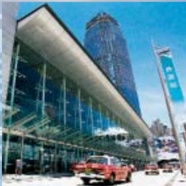
Hong Kong Station, Hong Kong

Measurement of intelligibility using the RASTI method.