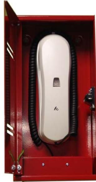
EmerCall Surface Outstation Handsets

The EmerCall Emergency Voice Communication System is a fixed, secure, bi-directional, full duplex voice communication system to assist fire fighters in an emergency in high rise buildings or large sites where radio communication may not work, and covers the operation of both fire telephones and disabled refuge systems. Where both systems are fitted to a building BS5839 Part 9:2003 specifies these should form a single system.